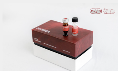
DIVERSA FluoGreen cell internalization Reagent