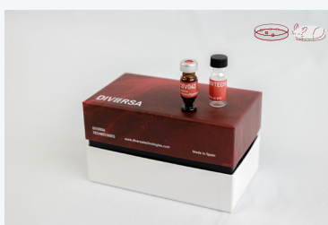
DIVERSA Peptide Delivery Reagent