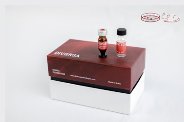
DIVERSA Protein Delivery Reagent