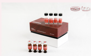
DIVERSA Small Molecule Delivery Reagent