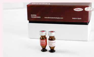
DIVERSA FluoGreen Small Molecule Delivery Reagent