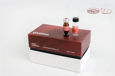
DIVERSA FluoGreen Protein Delivery Reagent