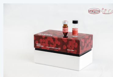
DIVERSA FluoGreen Peptide Delivery Reagent

Optimized technology, which can be packed and distributed as a ready-to-go reagent, with the aim of making it available to the entire research community.